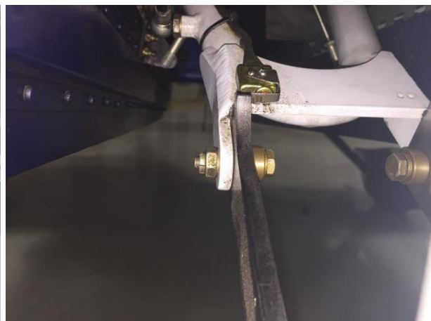
Figure 2 Improved Design Lower Drag Links