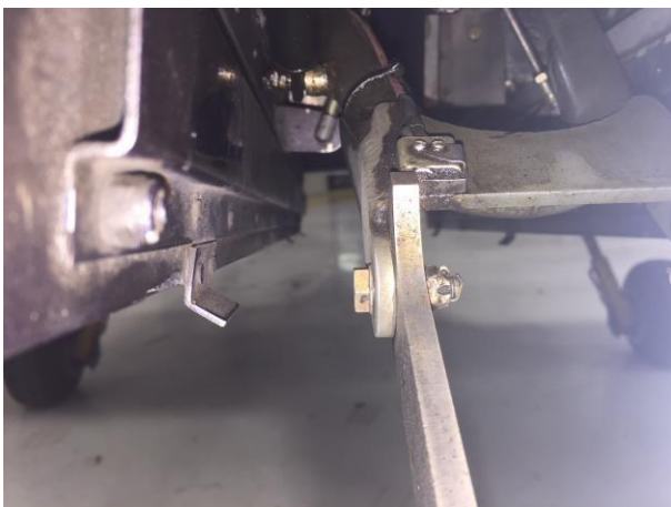
Figure 1 Original Design Lower Drag Links